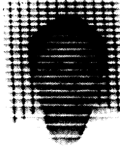
Mme Singaye Thérèse