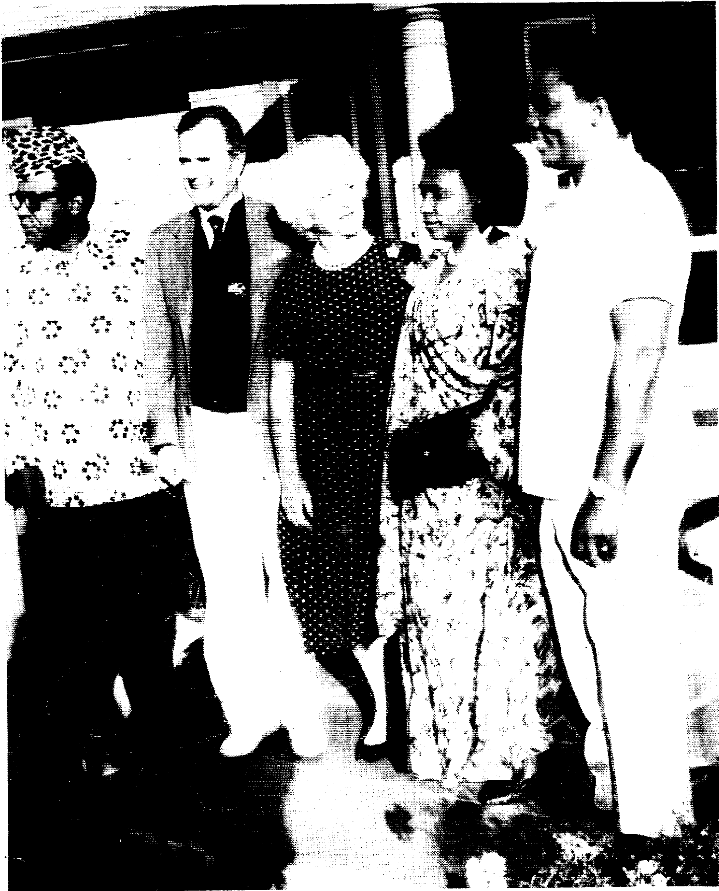
S'Ingabo z'Igihugu gusa zifuza ko Perezida Habyarimana akomeza kuyobora u Rwanda N'Abaperezida b'ibihangange bemeye ko bazafatanyana na Rubanda Nyamwinshi kumushyigikira. Kuri icyo foto murabona Mobutu wa Zaire - Bush w'Amerika n'abiwe. Ngo akuzuye umutima gasesekara ku munwa.