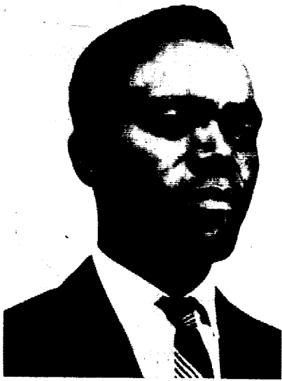
Dr KAYIBANDA M.D.R. Parmehutu