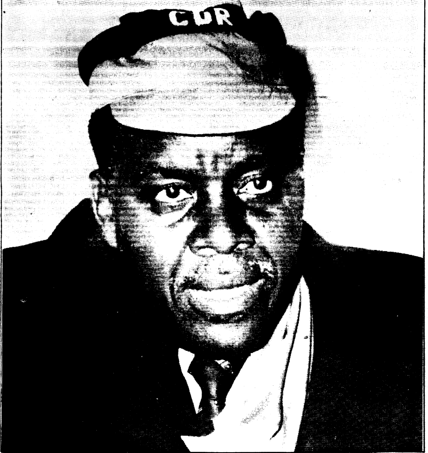
ISHYAKA RYACU NIRYO RITEGEHUKA, UNIKIZA RUBANDA NIRYO KISHYAMIRANYE NAR. KUBA...