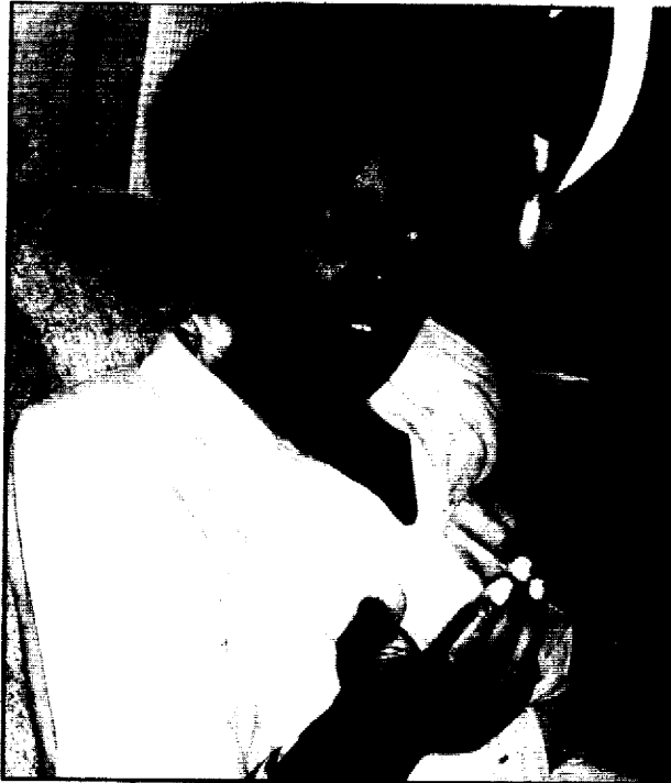
SYLVIE KINIGI MINISTRE W'INTEBE IMPORONA Y'UMUTUTSIKAZI

NJEWE NDABONA ABAHUTU NIBIHORERA ATA CAHA BAZOBA BAFISE, DORE BAGANDAGUWE KUVA KERA