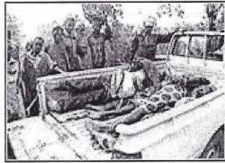
Hundreds of thousands were killed in the 1994 genocide

Friends of Sendashonga accuse the Kigali government of ordering his murder. He was shot and injured in an earlier attempt on his life in Nairobi in 1996, an attack that sparked the expulsion of Rwanda's diplomats from Kenya.