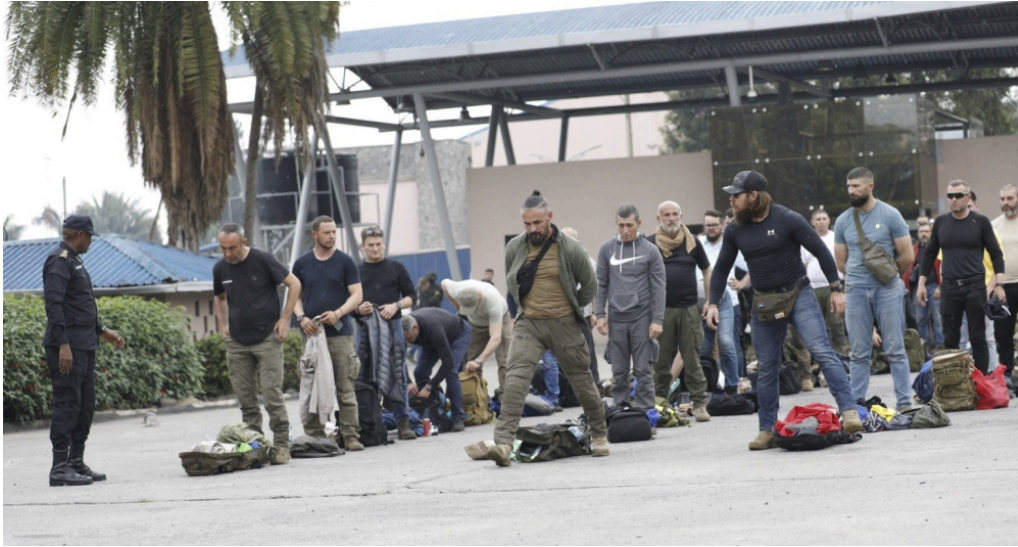
Close to 300 European mercenaries surrendered to M23 rebels and were allowed to cross into Rwanda before they were facilitated to take flights to their countries on Wednesday, January 29.

The rebels demand direct peace talks with the Congolese government, which has ruled out any possibility of talks with the rebels, calling them a terrorist movement. Regional initiatives have failed to end the war politically, with the Congolese government pursuing a military solution.