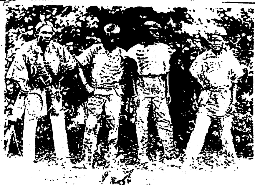
Habyarimana va inyuma y'izi mvururu cyangwa unyura inzira wanyujijemo KAYIBANDA.

Banyarwanda Banyarwa- noakazi, nyuma y'inyandiko abagejejeho isobanura uko baraso yamenekeye ku irembo rya Perezida Habyarimana igihe yari yacyuje ubukwe ku ya 9/8/92, namusabye kuva inyuma y'izi mvururu ngo zihoshe. Ni uko nziko izo mvururu ziterwa n'intera- hamwe ziba zigizwe akenshi n'abasivili bavanze n'abasi- likare babyitangiye, bakaba bakabakaba kuri 75. Muri izo nterahamwe harimo abakozi ba Leta; ab'ingenzi na none